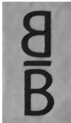
The Butterfield Brand