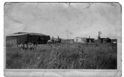
Butterfield Homestead (c. 1900)